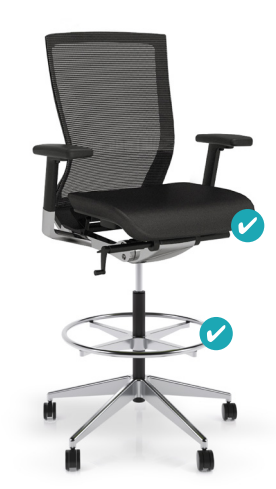
Drafting Gas Lift with Chrome Foot Ring & Black Leather Seat Cover