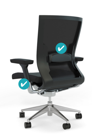
Balance Executive with Lumbar and Adjustable Arms