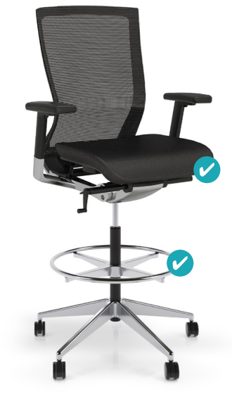
Drafting Gas Lift with Chrome Foot Ring & Black Leather Seat Cover