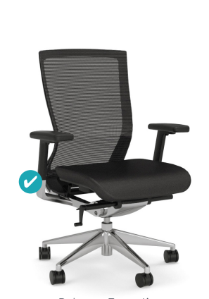
Balance Executive with Adjustable Arms