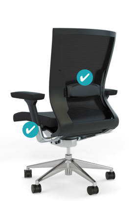
Balance Executive with Lumbar and Adjustable Arms