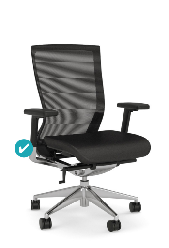
Balance Executive with Adjustable Arms