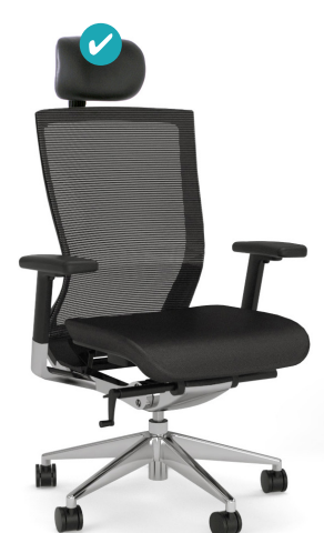
Balance Executive with Headrest