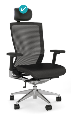
*Balance Executive with Headrest