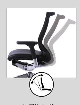
A. Tilt Action Simple, weight specific tilt action with four different recline presets.