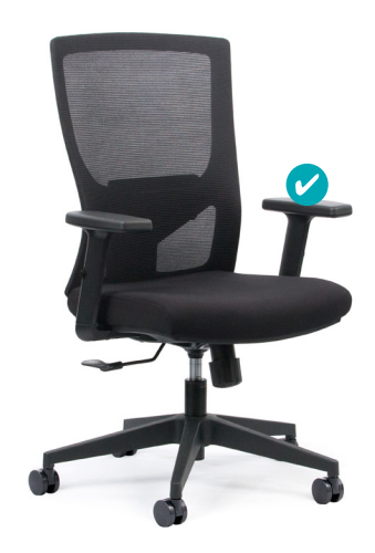
Optic Chair with Arms and Lumbar