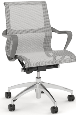
Scroll Grey Mesh Alloy Base