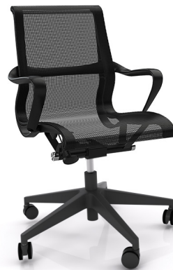
Scroll Black Mesh Nylon Base