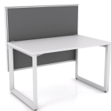
Anvil Single Sided Desk with Studio50 Screen