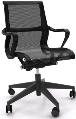
Scroll Black Mesh Nylon Base