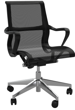
Polished base & Gas Lift upgrade for Black Scroll Chair