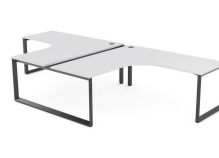
Anvil 2 User Double Sided 90° Workspace