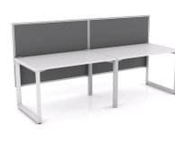
Anvil 2 User Single Sided Desk with Studio50 Screen