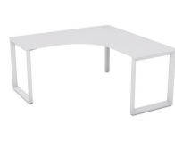
Anvil Single Sided 90° Workspace