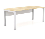
Axis Single Sided Desk with Modesty