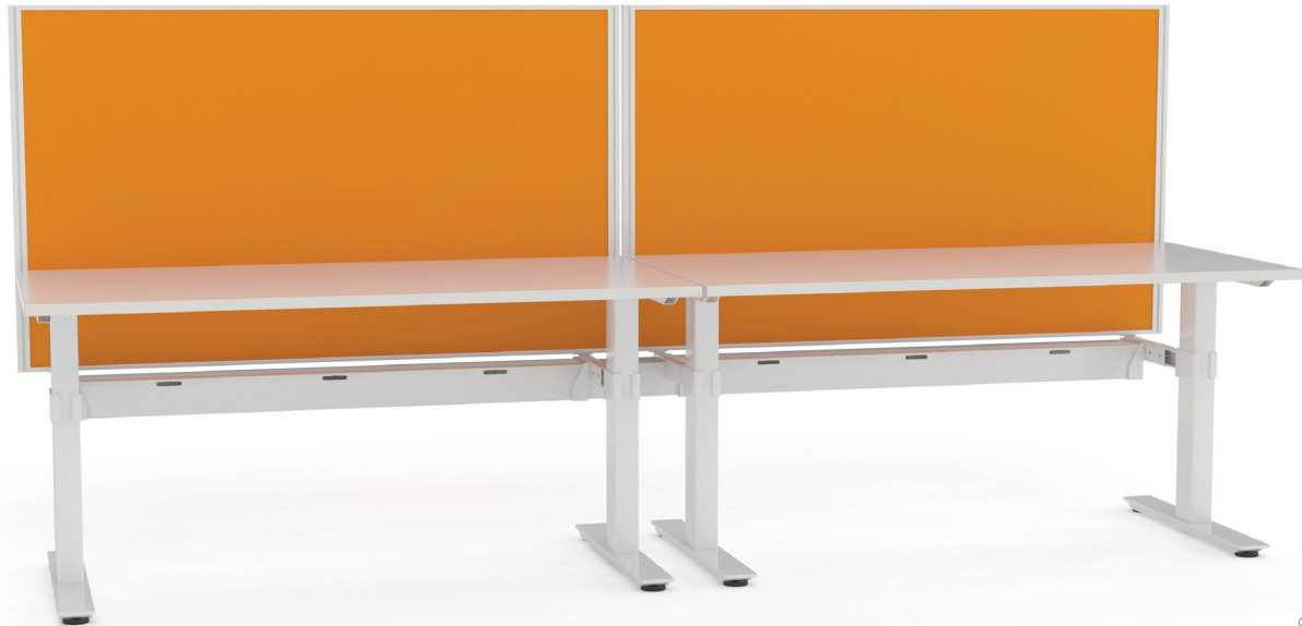
Anvil Fixed Height desking straightline