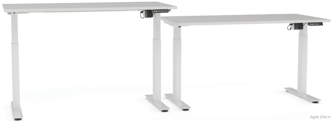
Agile Electric Adjust desking straightline