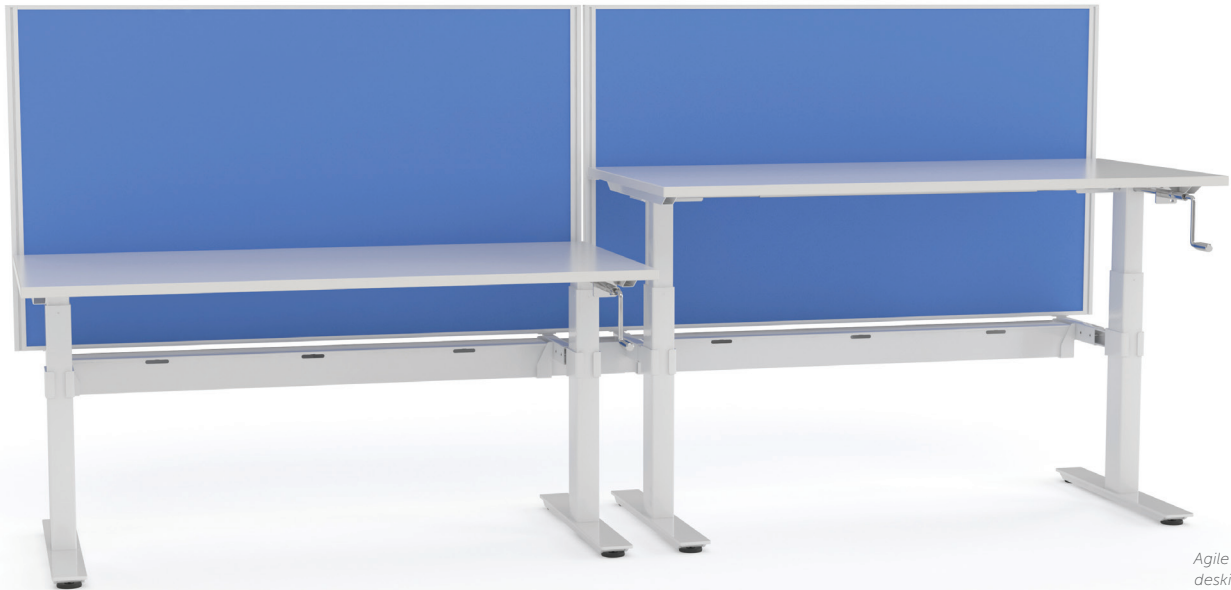
Agile Winder Adjust desking straightline