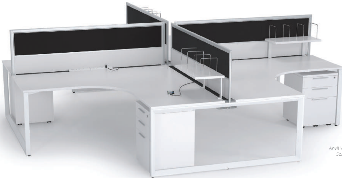
Anvil Workstations with Split Screens in Black E-panel