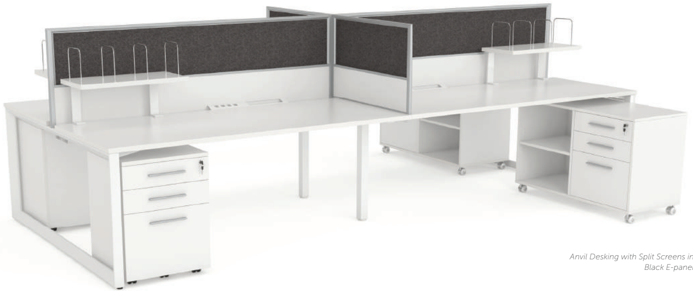
Anvil Desking with Split Screens in Black E-panel