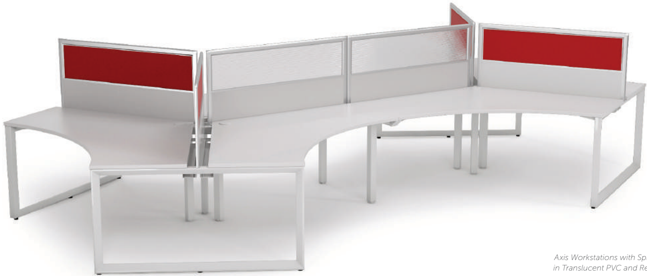
Axis Workstations with Split Screens in Translucent PVC and Red E-panel