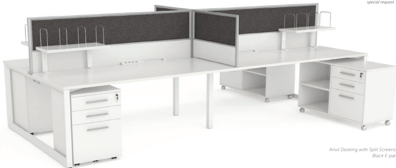
Anvil Desking with Split Screens in Black E-panel

Available to GECA certification at special request