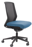
Motion Sync with optional seat cover