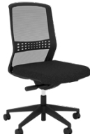
Motion Sync with lumbar