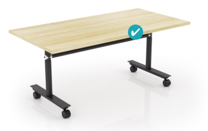
Ascend Tech Adjust Flip Table Black Frame with New Oak Worktop