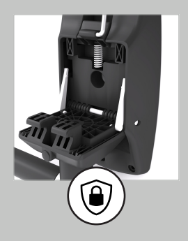
C. Safety Locking When tilted upright, the mechanism will lock to prevent an accidental return to horizontal.