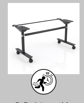
B. Fast Assembly Comes mostly assembled and can be installed in less than 5 minutes.