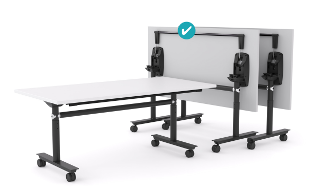
Ascend Tech Adjust Flip Table + 2 Nesting