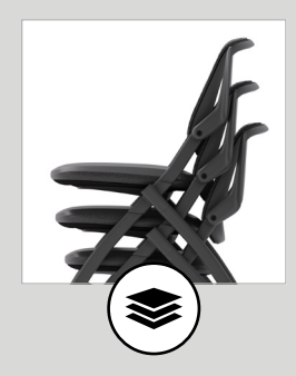
A. Stackable order with additional mounts.