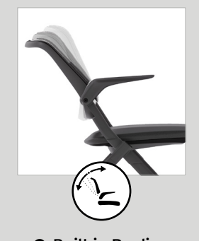
C. Built in Recline Backrest has a built in recline with long sitting times.