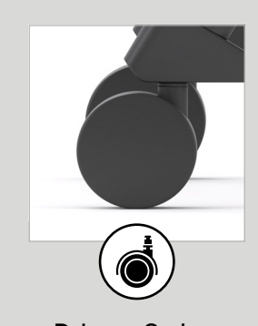
D. Large Castors Large 60mm castors for ease of movement at a conference or training session.