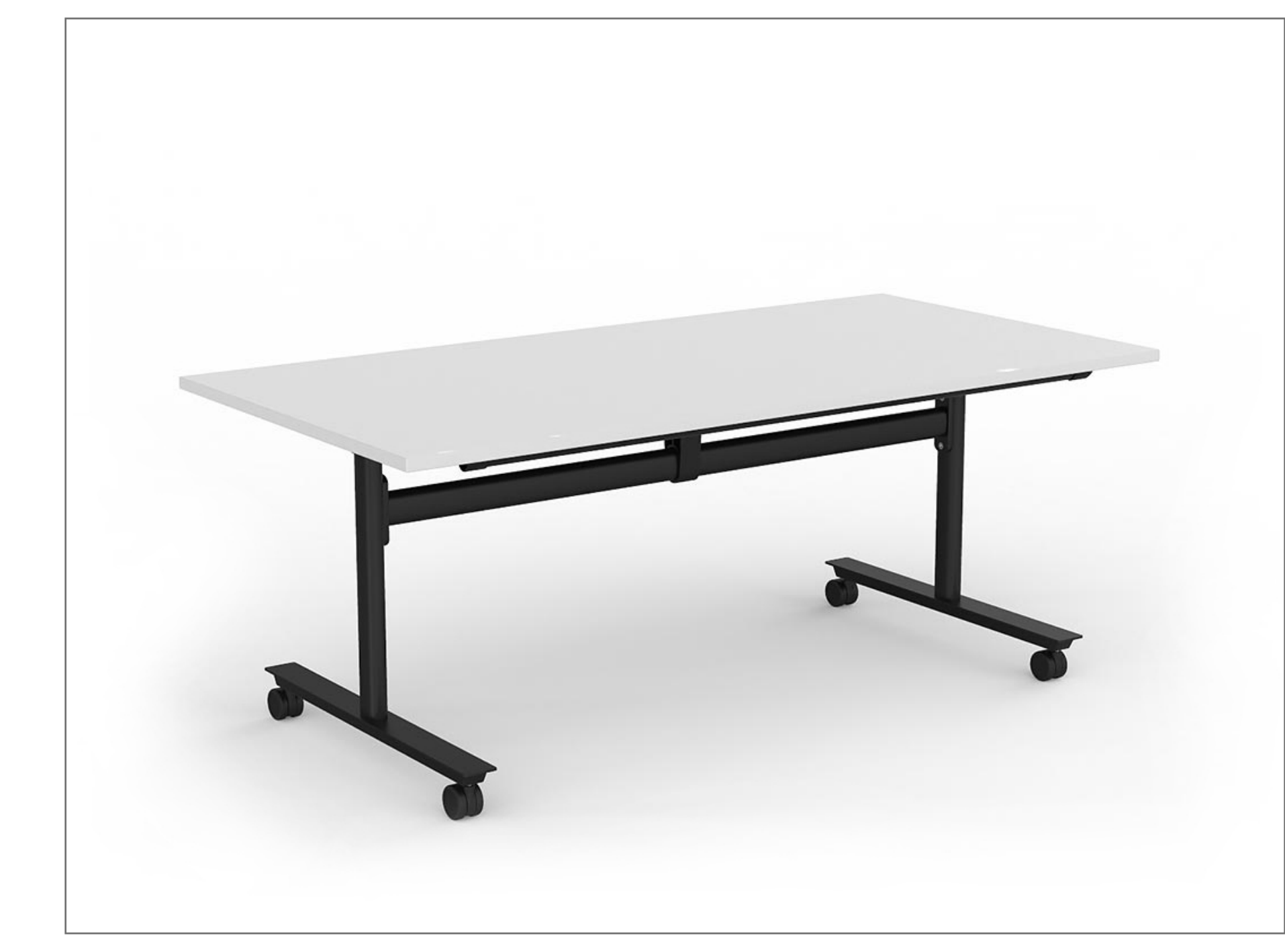
The Agile Flip Table is the perfect solution for larger workspaces up to 2400mm wide by 1200mm deep. If you're after a sturdier profile or a round tabletop.

For these spaces, flip top tables with caster wheels can be used to create easily modifiable desk arrangements. Simply flip the tabletop with the one-handed mechanism, lock into place and wheel the frame into storage or its new location.