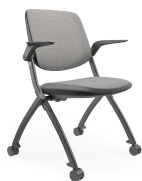
Logic with Arms