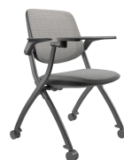
Logic with Arms & Table