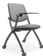
Logic with Table