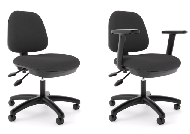
Evo Chair No Arms