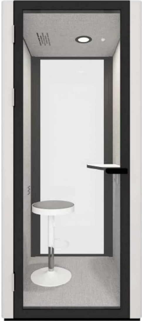
4. Phonebooth #4