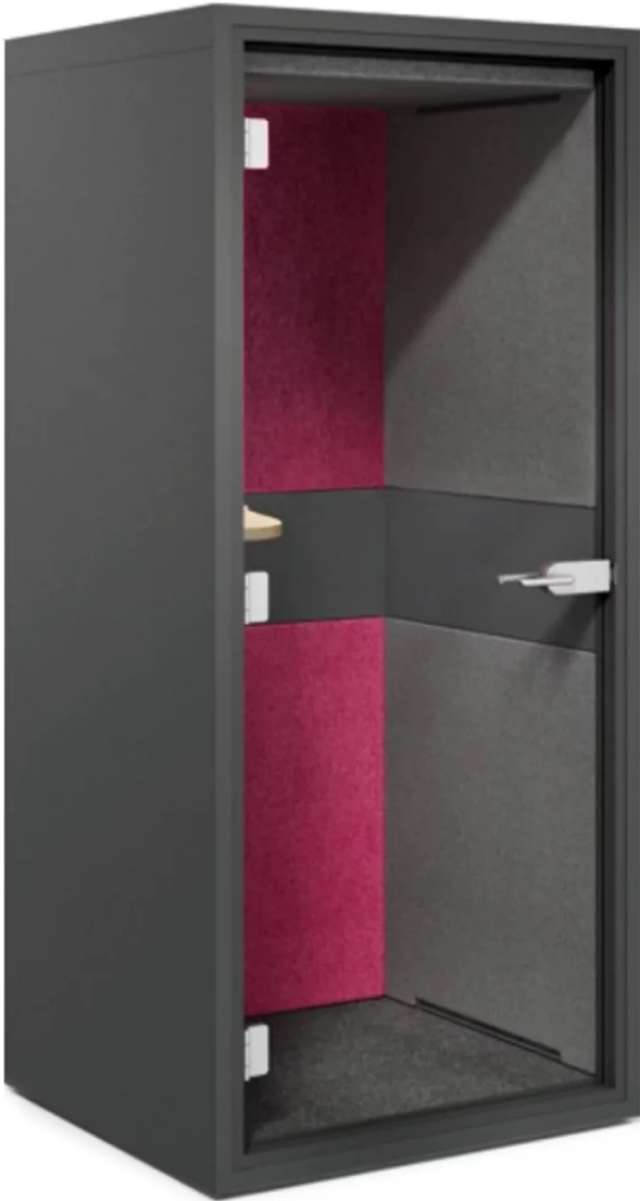
3. Phonebooth #3