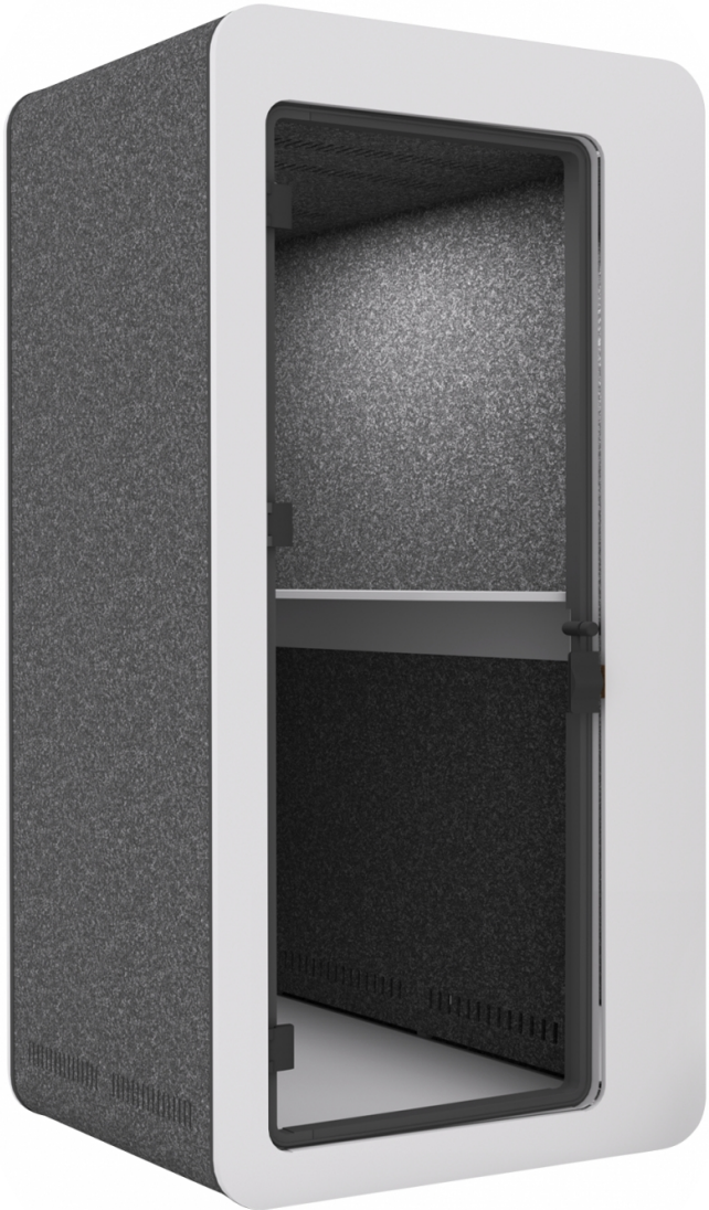
2. OLG Qzone