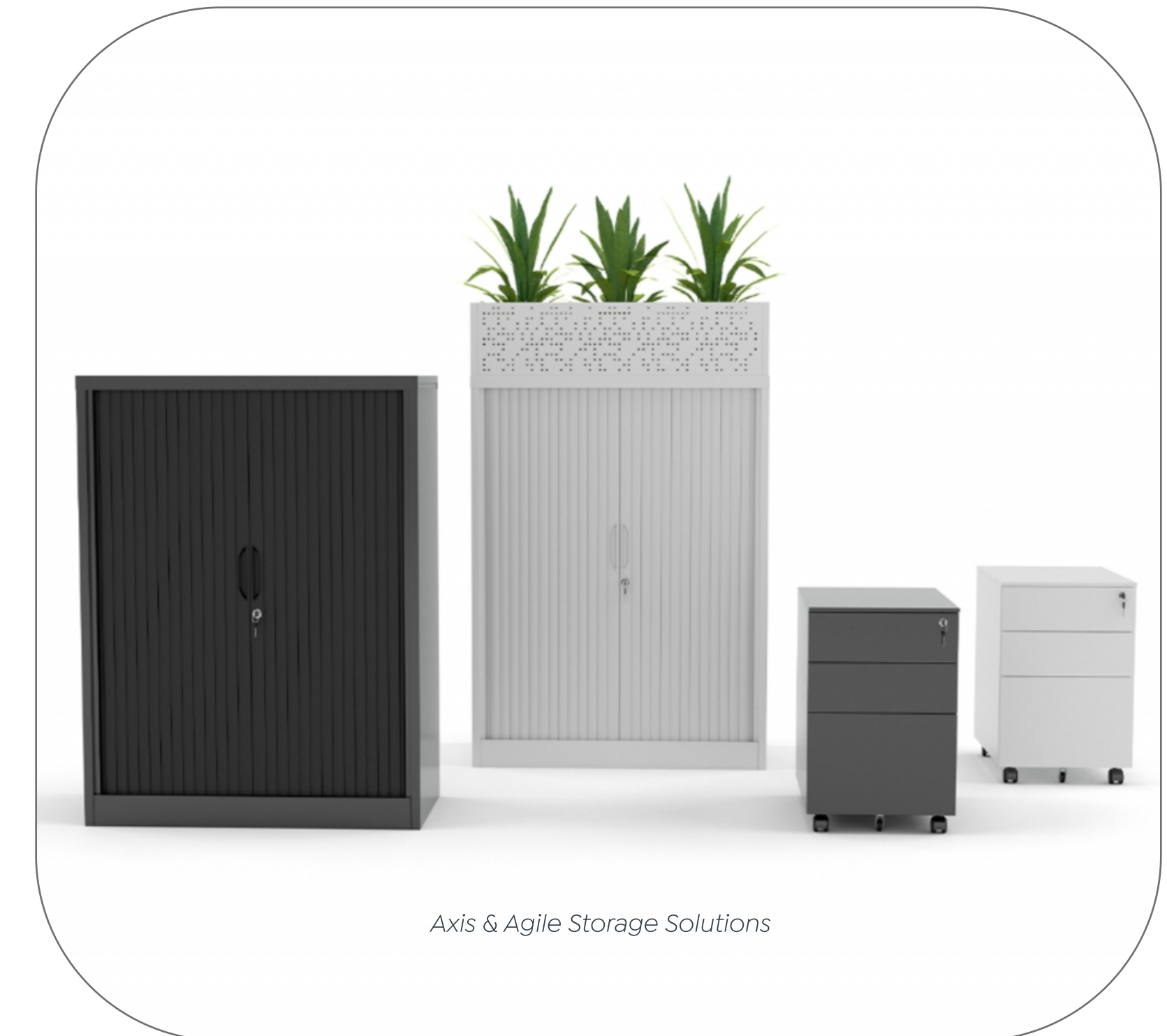
Axis & Agile Storage Solutions

OLG have innovative storage solutions in both the Axis and Agile ranges. Everything from pedestal cabinets to bookcases, planter boxes and tambour units.