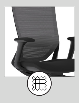
A. Mesh-Wrapped Backrest High quality, flexible meshwrapped backrest with adjustable 4 seperate ways by 3 different lumbar provides ergonomic support for all day comfort.