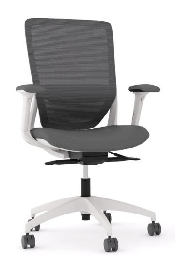
Engage Chair with Upgraded Arms - White