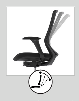
C. Synchro Tilt Mechanism To ensure a smooth adjustment, an intuitive synchro mechanism tilts the seat as the back reclines.