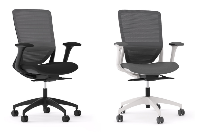
Engage Chair with Upgraded Arms - Black