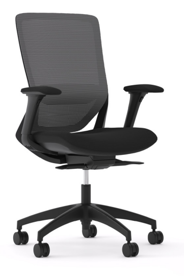
Engage Chair with Upgraded Arms - Black