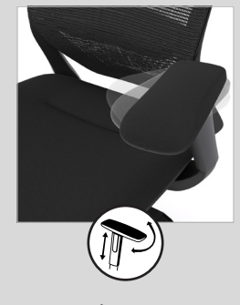
B. 4D Adjustable Arms Armrests can be adjusted pivot axes and also height adjustable.