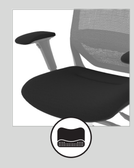
D. Moulded Foam Uphostered Seat & Armrests Seat and armrest have seamed upholstered moudling foam for additional comfort.