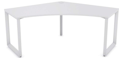
Anvil 120° Single User Desk