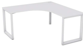
Anvil 90° Single User Desk