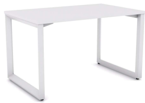
Anvil Single Sided Desk

Anvil Desking range includes Single sided, Double sided, 90° and 120° desks with single to multiple user possible configurations.