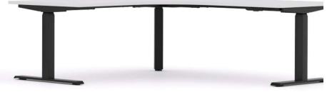
90° 3C Electric Standing Desk