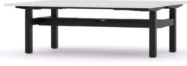
Double Sided 3C Electric Standing Desk