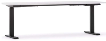
Single Sided 3C Electric Standing Desk