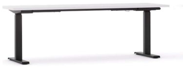
Single Sided 3C Electric Standing Desk