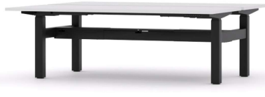
Double Sided 3C Electric Standing Desk