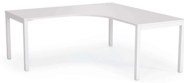
Axis 90° Single User Desk