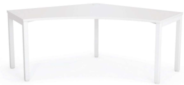
Axis 120° Single User Desk