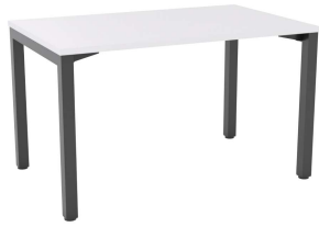
Axis Single Sided Desk

Axis Desking range includes Single sided, Double sided, 90° and 120° desks with single to multiple user possible configurations.