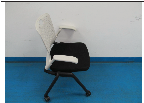
Sample with black surface and black bottom on seat as received – View 2