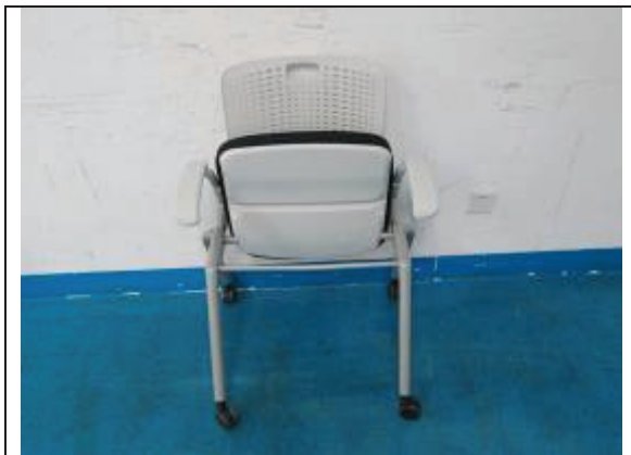
Sample with black surface and white bottom on seat as received – View 3