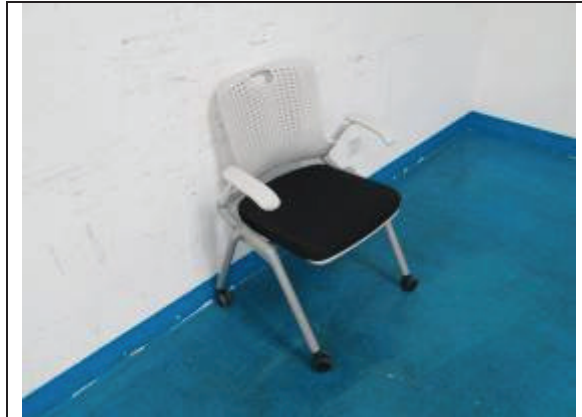
Sample with black surface and white bottom on seat as received – View 2