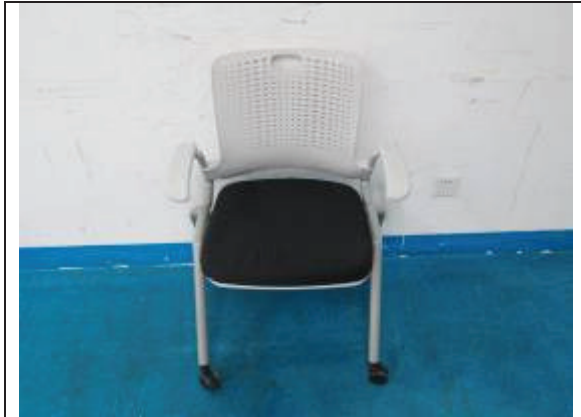
Sample with black surface and white bottom on seat as received – View 1