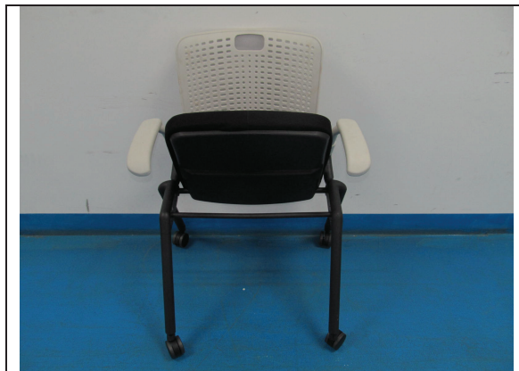
Sample with black surface and black bottom on seat as received – View 3