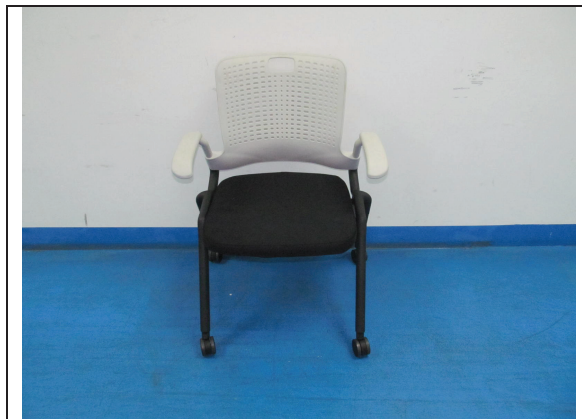
Sample with black surface and black bottom on seat as received – View 1