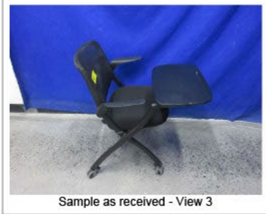
Sample as received - View 3