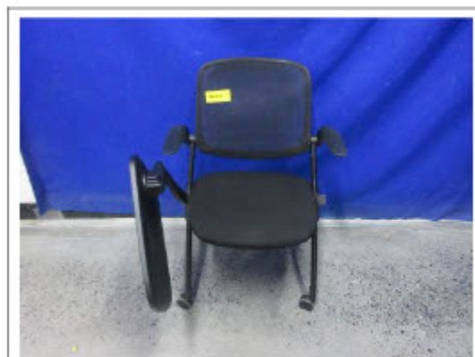
Sample as received - View 2