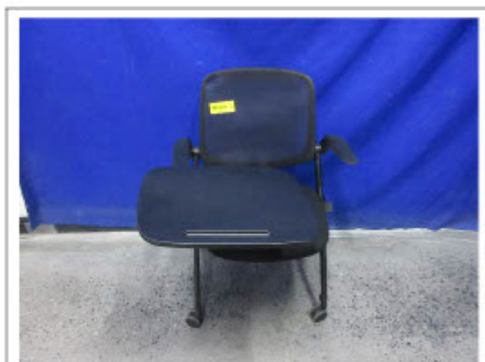
Sample as received - View 1