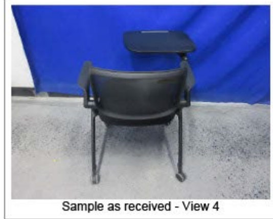
Sample as received - View 4