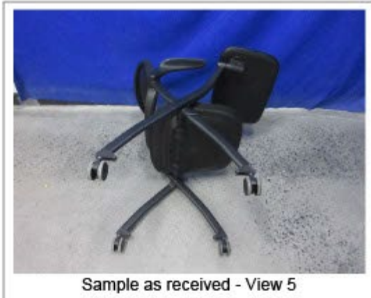
Sample as received - View 5