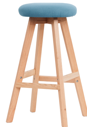
Luna Oak Barstool