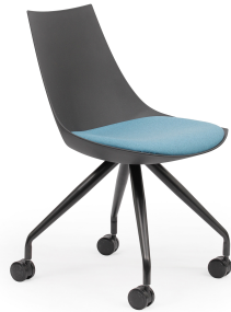
With Castor Base