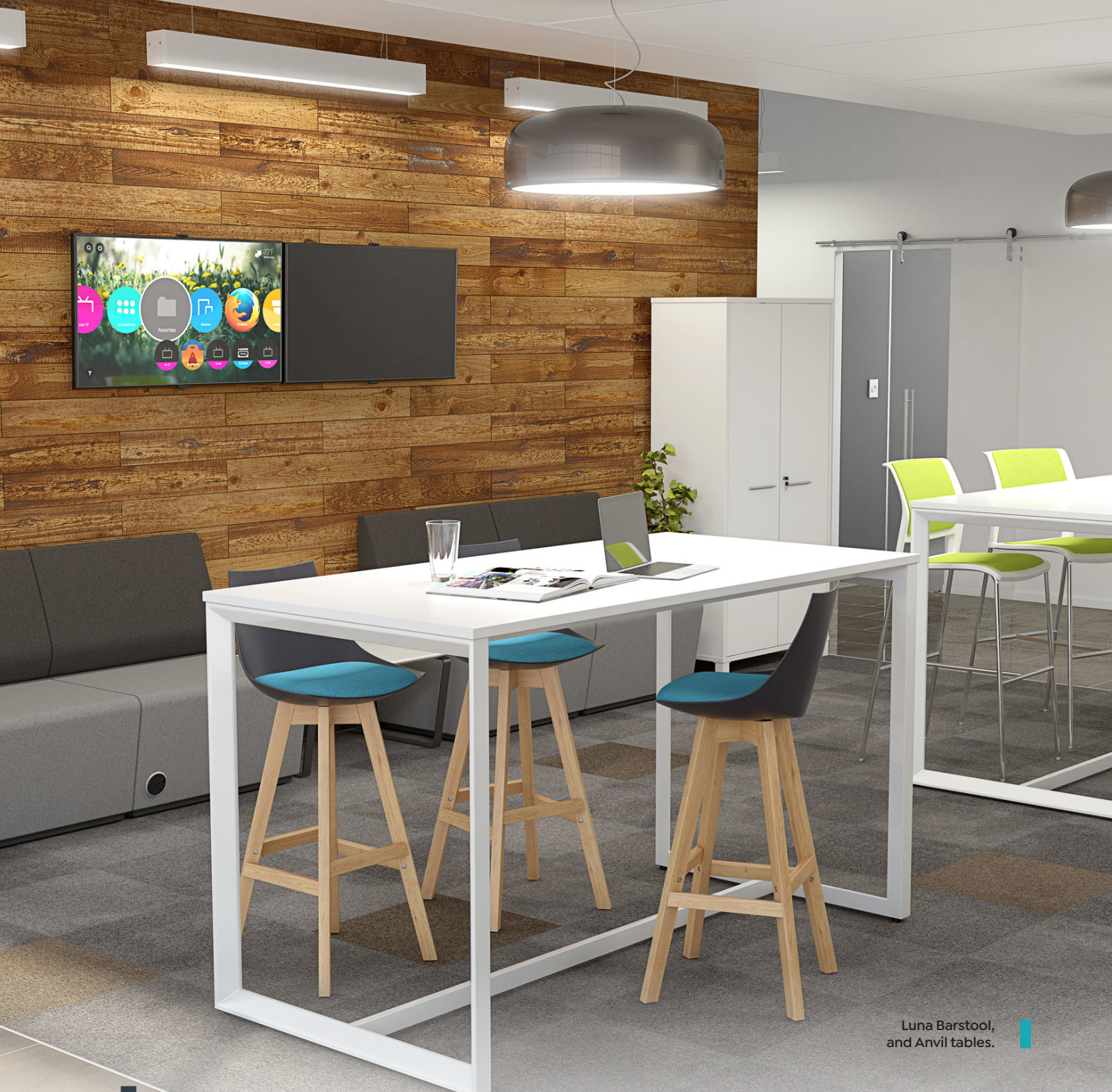
Luna Barstool, and Anvil tables.