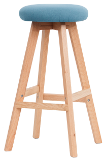
Oak Button Barstool

The Luna Range consists of the Oak Barstool and the complimentary Oak Button Barstool, as well as the Castor Base with Steel Legs.