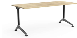
Modulus Single Sided Desk