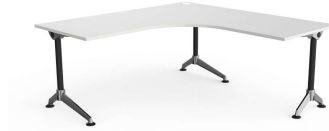
Modulus 90° Desk