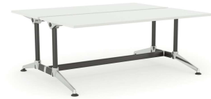
Modulus Shared Double Sided Desk