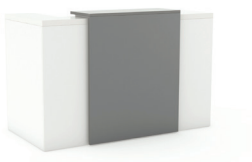
Anvil Straight Reception