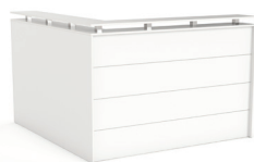
Axis Corner Reception with Pop-top