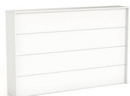
Axis Straight Reception without Pop-top