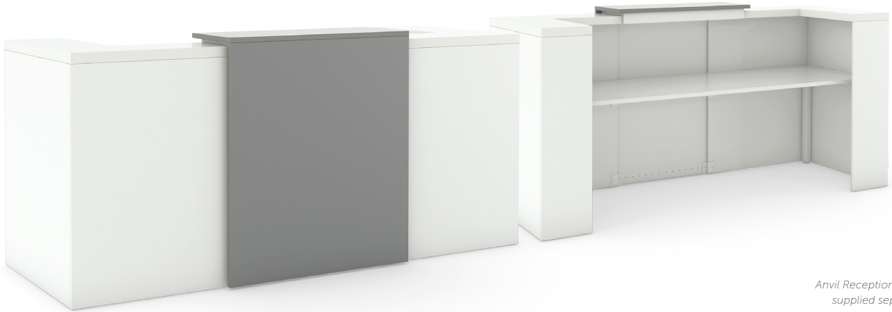
Anvil Reception - Desk supplied separately