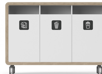
Mobile Rubbish Bin W1670 x H1220 mm