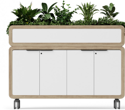
Mobile Credenza + Planter W1650 x H1220 mm