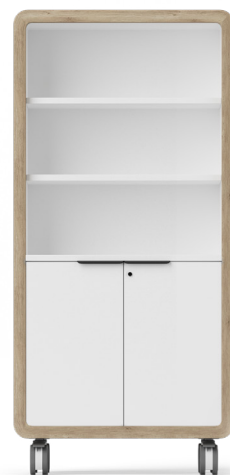
Mobile Half Locker / Half Bookcase W900 x H1920 mm