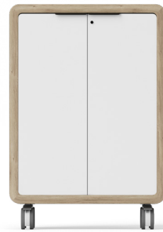
Mobile Cupboard W900 x H1320 mm