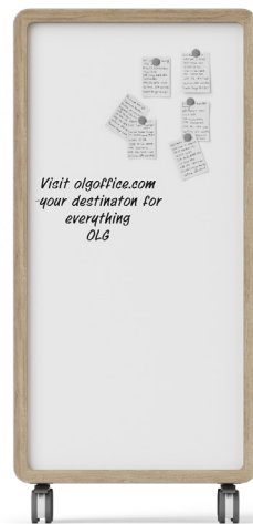
Mobile Whiteboard W900 x H1920 mm