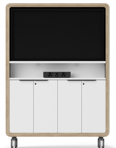
Mobile TV W1358 x H1920 mm