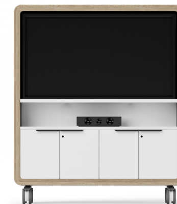
Mobile TV W1358 x H1620 mm