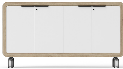
Mobile Credenza W1650 x H920 mm