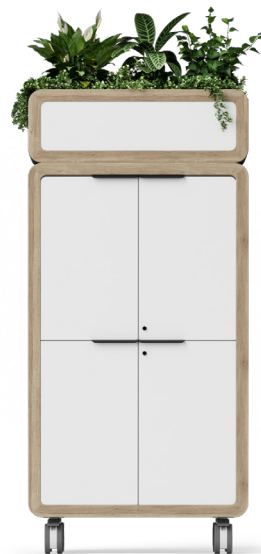
Locker + Planter W900 x H1920 mm