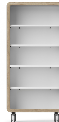
Mobile Bookcase W900 x H1920 mm