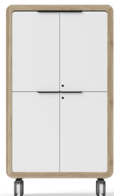
Mobile Locker W900 x H1620 mm