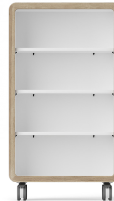
Mobile Bookcase Small W900 x H1620 mm