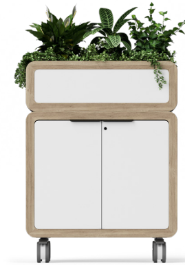
Mobile Credenza + Planter W900 x H1220 mm