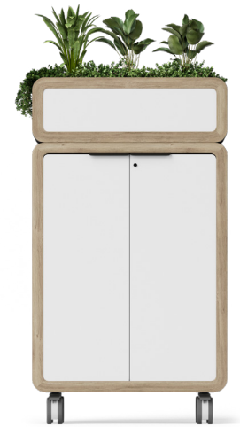
Mobile Cupboard + Planter W900 x H1620 mm