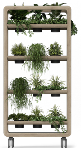
Mobile Planter W900 x H1920 mm