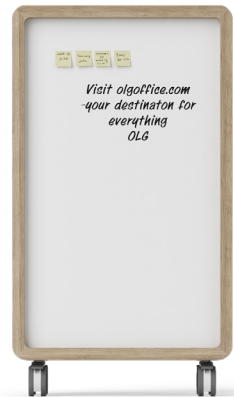
Mobile Whiteboard Small W900 x H1620 mm