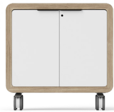
Mobile Credenza W900 x H920 mm