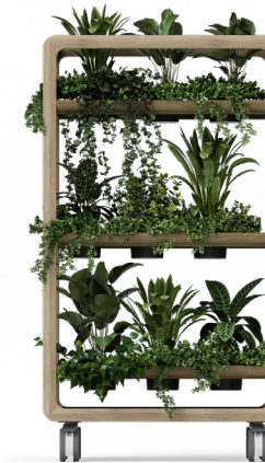
Mobile Planter W900 x H1620 mm