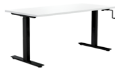
Agile Winder Single Sided Desk