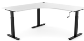
Agile Winder 90° Single Sided Workspace