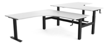
Agile Winder 90° Double Sided Workspace