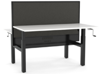
Double Sided Desk Black Frame with White Worktop and Studio50 Splice Charcoal Hung Screen