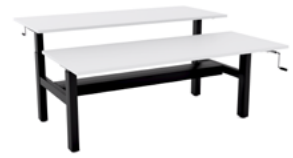
Agile Winder Double Sided Desk