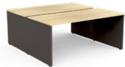
EkoSystem Double Sided Desk