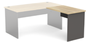
EkoSystem Desk & Return