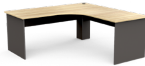
EkoSystem 90° Workstation