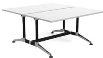
2 User Double Sided Workspace Black Powdercoat finish

Cable trays - system includes desk to desk bridges, power/ data mounting points (inside the tray or on the vertical face) and cable snakes to the desktop