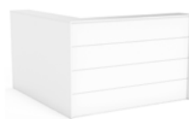
Axis 90° Corner Reception