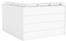
Axis 90° Corner Reception with Pop-top

The Axis straight reception counter boasts a sleek exterior look for a great first impression. The reception uses 18 mm White melamine on an E1 grade substrate with matching PVC edge and aluminium beading detail on the front. Options include a desk and pop up facade.