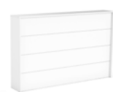
Axis Straight Reception