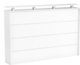
Axis Straight Reception with Pop-top