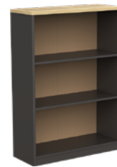
Ekosystem 3 Level Bookcase