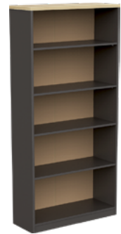
Ekosystem 5 Level Bookcase