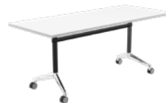
Uni Flip Table