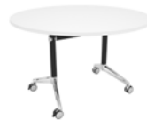
Uni Flip Round Table