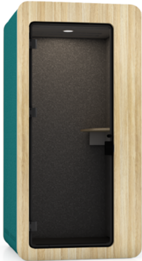
Qzone with New Oak Frame and Radius18 Ice Blue Finish