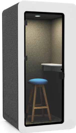
Qzone with White Frame and Charcoal Grey Finish