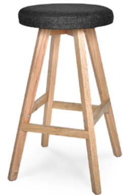
Qzone Button Stool Additional Upgrade